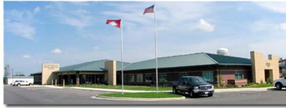
110 South Amity Road - Conway, Arkansas 72032