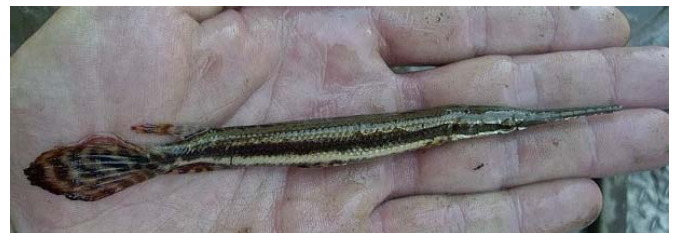
Spotted gar, Lepisosteus oculatus

To order: Online: http://www.fisheries.org/cgi-bin/hazel-cgi/hazel.cgi Phone: (678) 366-1411, or Fax: (770) 442-9742 Email: afspubs@pbd.com