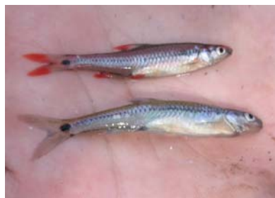
Taillight Shiner, Notropis maculatus