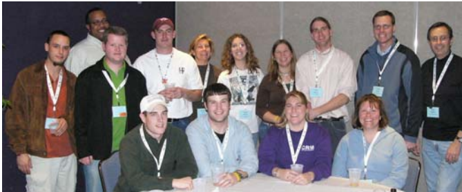
ECU-AFS members and alumni at the 2005 AFS Southern Division Meeting, Virginia Beach, VA.

members to host the 5th Annual Colloquium in November 2005. Of course, we accepted it! Planning for this event will begin this summer and ECU-AFS is thankful for the support offered by the West Virginia University and NC State AFS student subunits. This will certainly be an exquisite accomplishment for ECU-AFS.